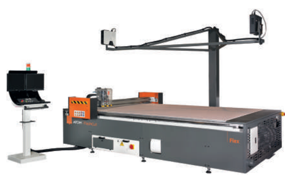
FlashCut Flex 3015 S