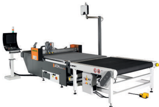
FlashCut Twins EMH 1515 B/2