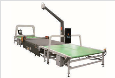
Solution with independent stations

Collecting of cut pieces: the leather is automatically moved to the collecting area. Through a proper pedal the operator can move the cut pieces near his workspace to easily collect them. A projection system highlights the cut pieces with colors and codes, ensuring a quick collecting and no errors.