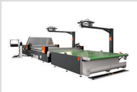
Solution with built-in acquisition station