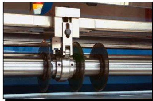
LOWER COUNTER ROLLER Indispensable accessory for heavy applications.

Officina Meccanica IMESA s.r.l. Viale Industria 106 / 108 - 27025 Gambolò (PV) Italy Tel. +39 0381 930708 - Fax +39 0381 930825 www.imesasrl.it imesa@imesasrl.it