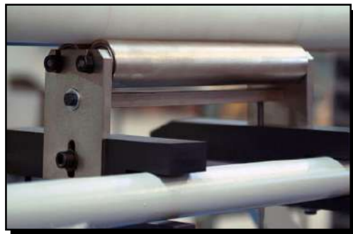
UPPER COUNTER ROLLER Indispensable accessory for heavy applications.