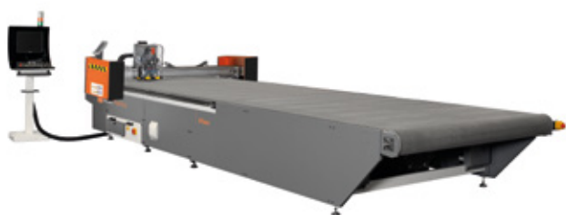
FlashCut Flex 3015 B/2