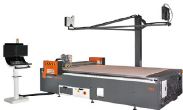
FlashCut Flex 3015 S